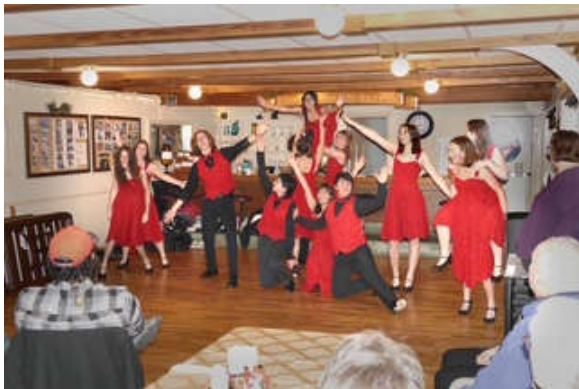
Show Stoppers at SYC 2024