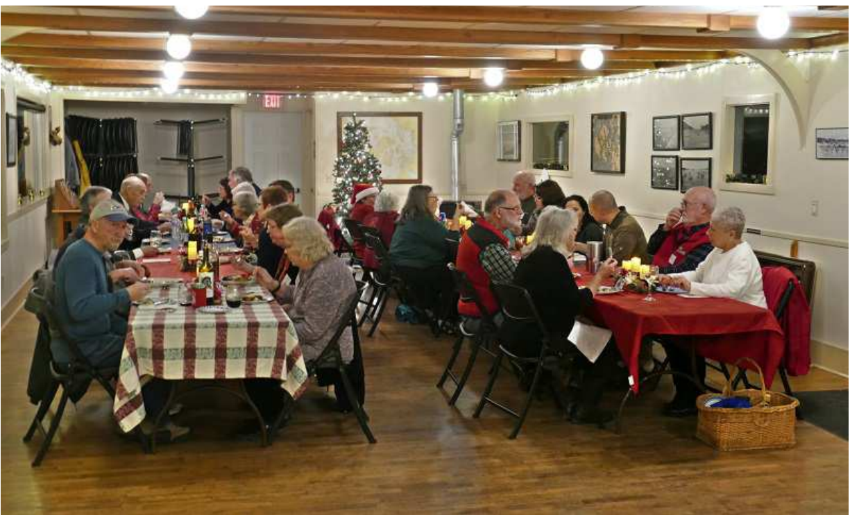
Good food, good fellowship, good entertainment

I hope you all have a joyous season and once again remind you of all that we have and to give of your time, talent and treasure to those around less fortunate.