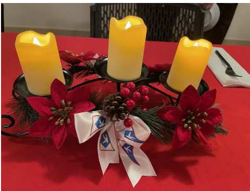
Centerpiece by Jodi