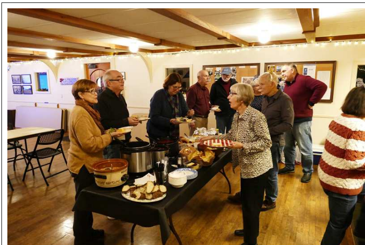
SYC New Year's Chili Feed 2019

The club will provide chili and cornbread. Other details to come via email, but start culling through your favorite LPs now because you can bring only one!