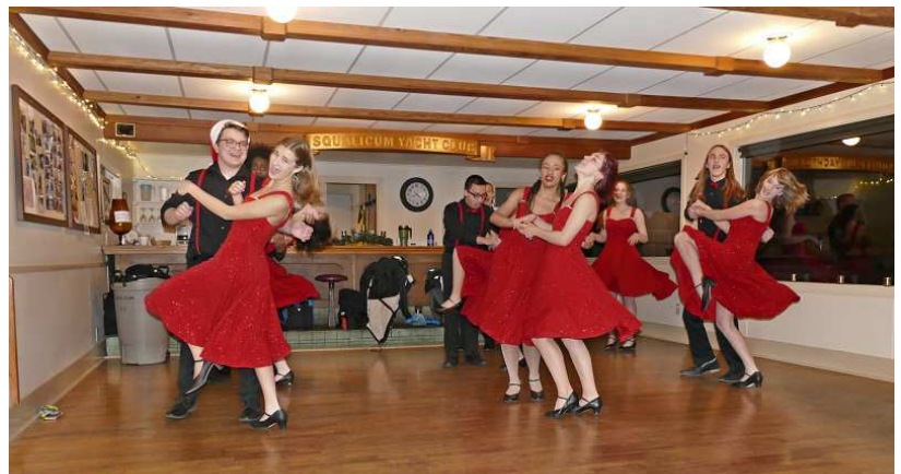
The Show Stoppers stop the show