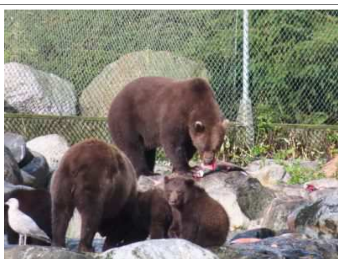
Bears outside the fish hatchery