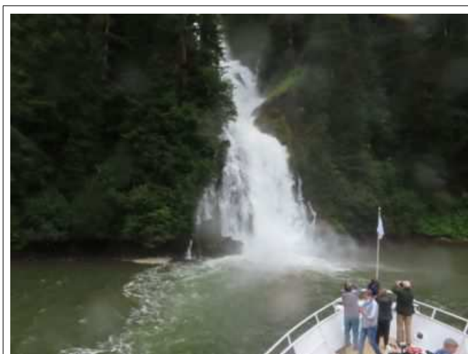
Close up to a waterfall