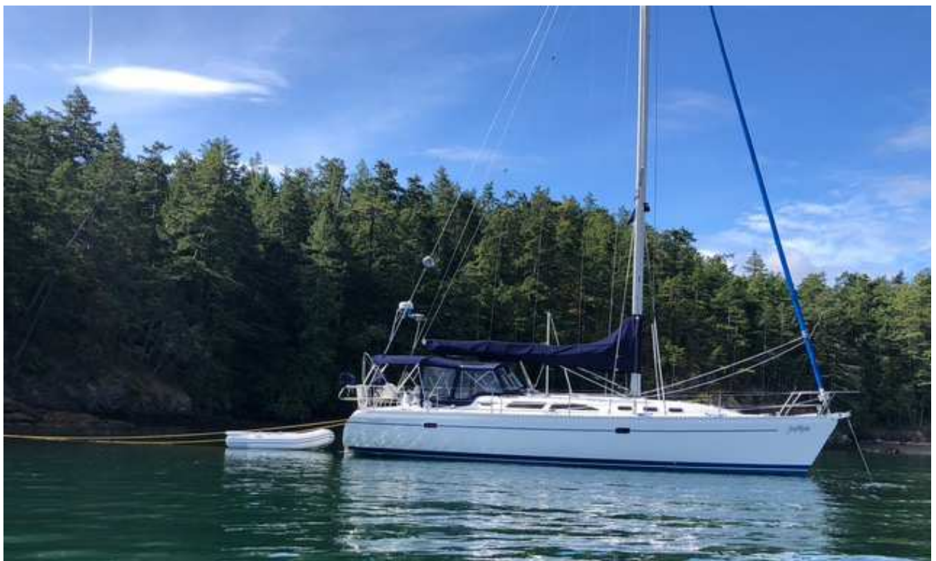
JoyRide