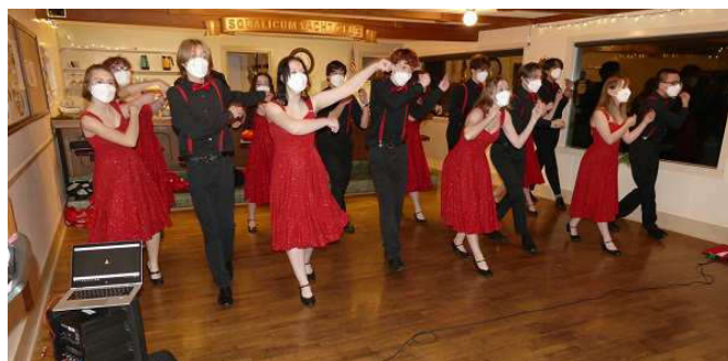
Showstoppers delight SYC once again