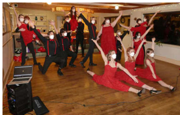
The Bellingham High Showstoppers Christmas Party 2021