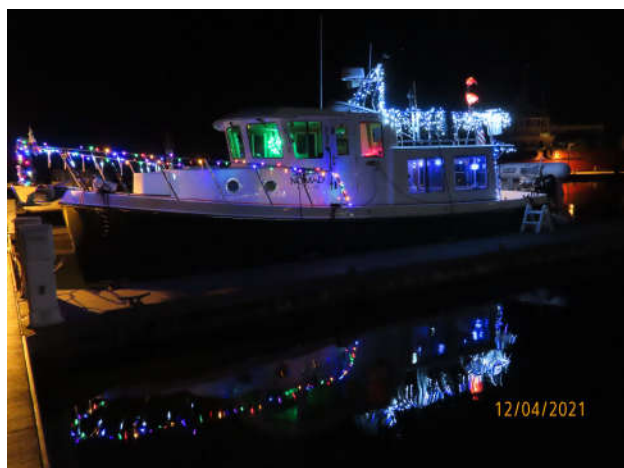
Salish Nomad makes the season bright at Cap Sante