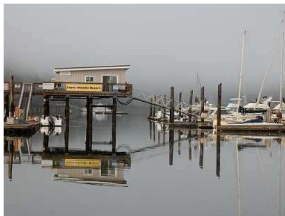
Fisherman Bay 2019