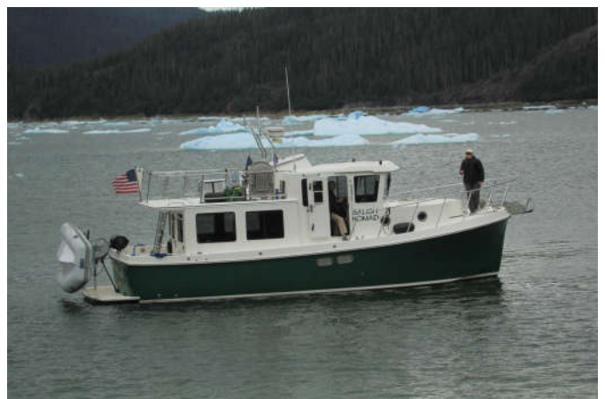
Salish Nomad at Le Conte Glacier