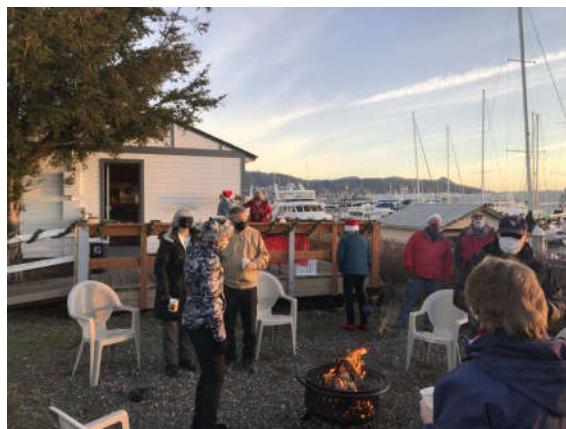
2020 Food Drive and Outdoor Social