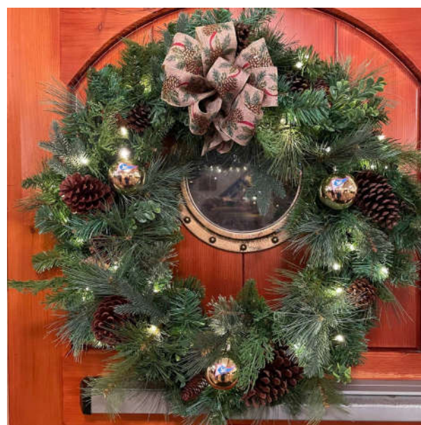
Holiday Wreath by Jodi Steel-Jones welcomes members to SYC Christmas party