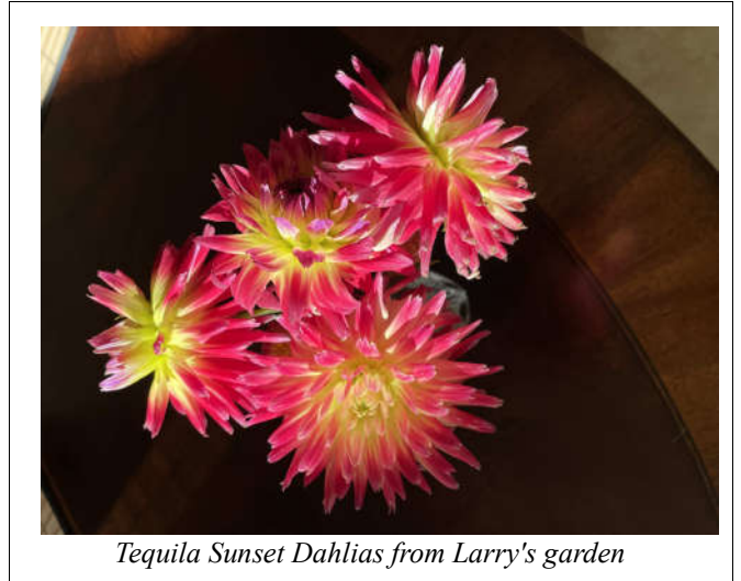
Tequila Sunset Dahlias from Larry's garden