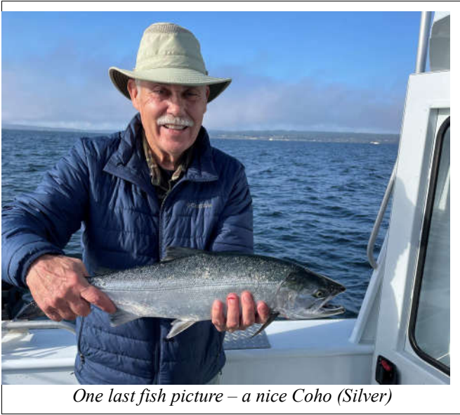
One last fish picture – a nice Coho (Silver)

and growing dahlias. It's his second year growing dahlias and he says he loves the new hobby.