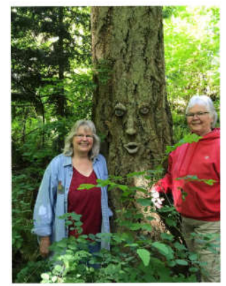
Vendovi Island photos