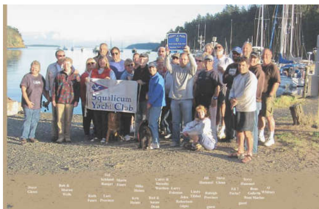
2007 SYC Work Party at Sucia Adopt-A-Park Sign